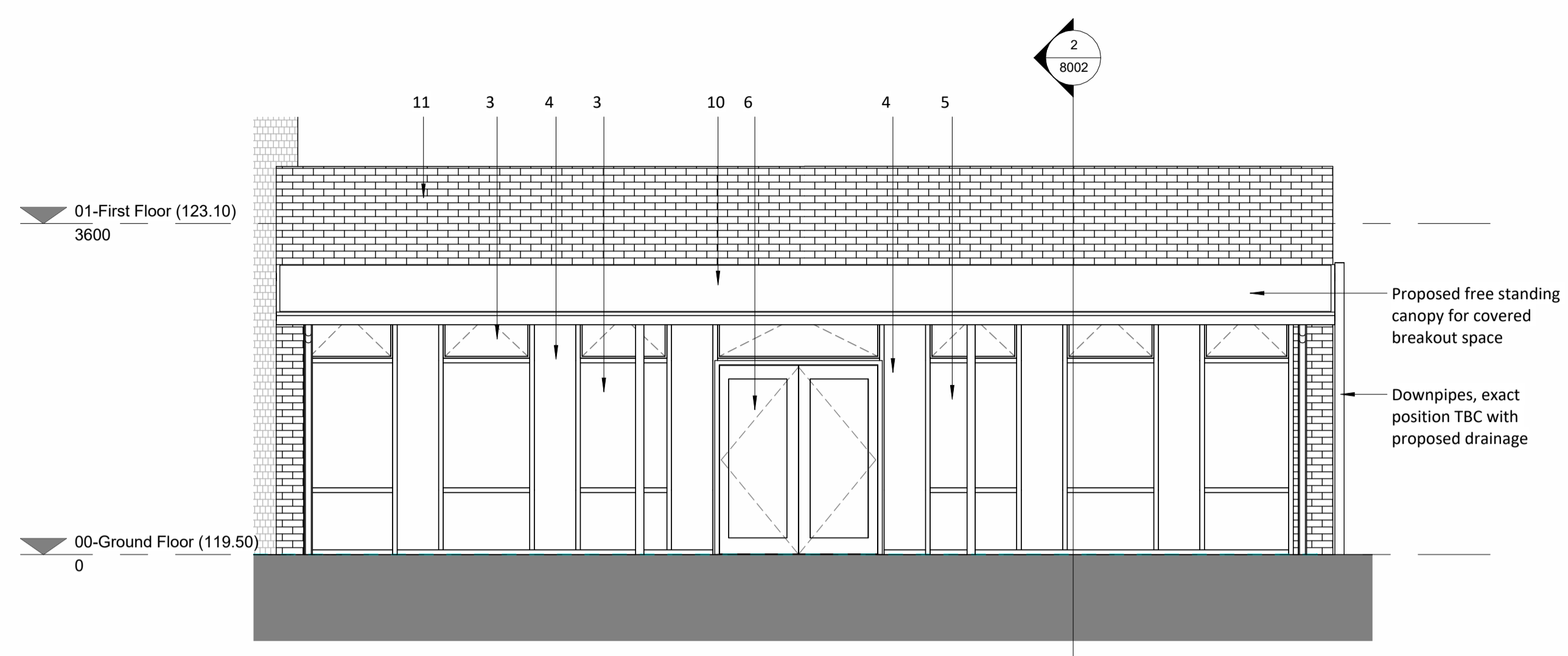
1 Dining Room Elevation - Front 1:50