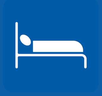
Sleep alone, if possible