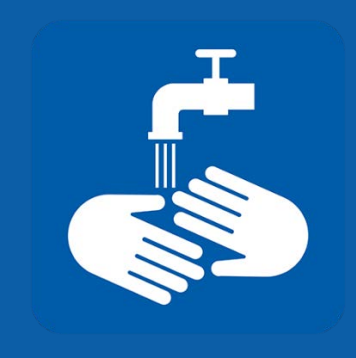
Regularly wash your hands