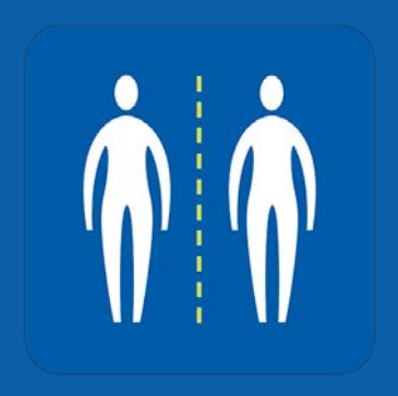
Avoid close contact with other people