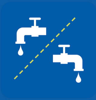
Use separate facilities, or clean between use