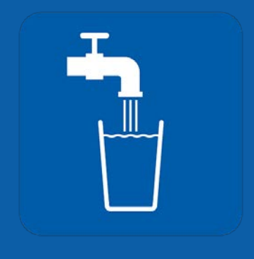
Drink plenty of water